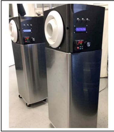
Figure 3: University of Maryland Ice RoCo prototype 18